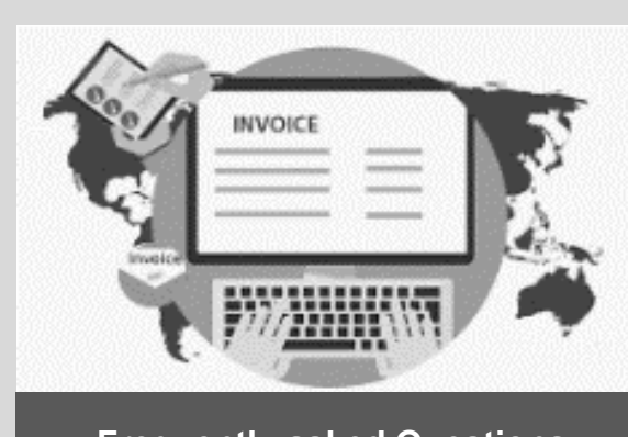
Frequently asked Questions