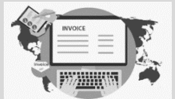
Frequently asked Questions